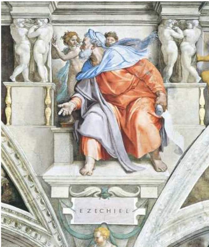
Ezekiel by Michelangelo Buonarroti

Theme: His Rise to Happiness is My Responsibility