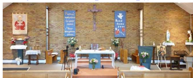
Beautiful flower decorations in our church for the Assumption of Mary

cafod.org.uk/donations/one-off? Amount=25& Appeal=121949