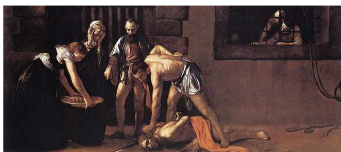
The Beheading of St John the Baptist painted by Caravaggio

St. John is the Patron saint of the Knights Hospitaller and is believed to protect pilgrims to and from the Holy Land.